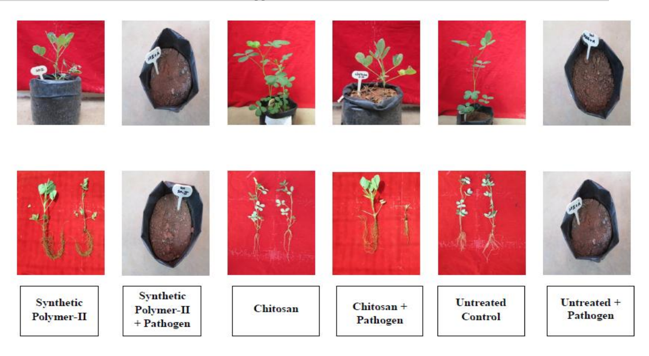
Plate B: Effect of synthetic polymer and biopolymer chitosan treated seed on growth parameters and antifungal activity against collar rot disease of groundnut in pot culture

Int. J. Pure App. Biosci. 5 (4): 2031-2037 (2017)